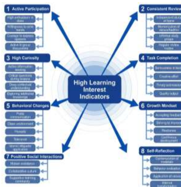
Figure 3. Students' learning interest

integrated cognitive, affective, and conative dimensions. The findings of this research strengthen the theory by providing empirical evidence that, when learning strategies are designed holistically and contextually, the three dimensions of learning interest can develop simultaneously and mutually reinforce one another. However, this research also found additional dimensions that have not been extensively explored in previous theories, namely the social-communal dimension of learning interest reflected in positive social interaction and a culture of mutual assistance among students, as well as the spiritual-reflective dimension evident from students' ability to conduct self-reflection and awareness of their religious identity.