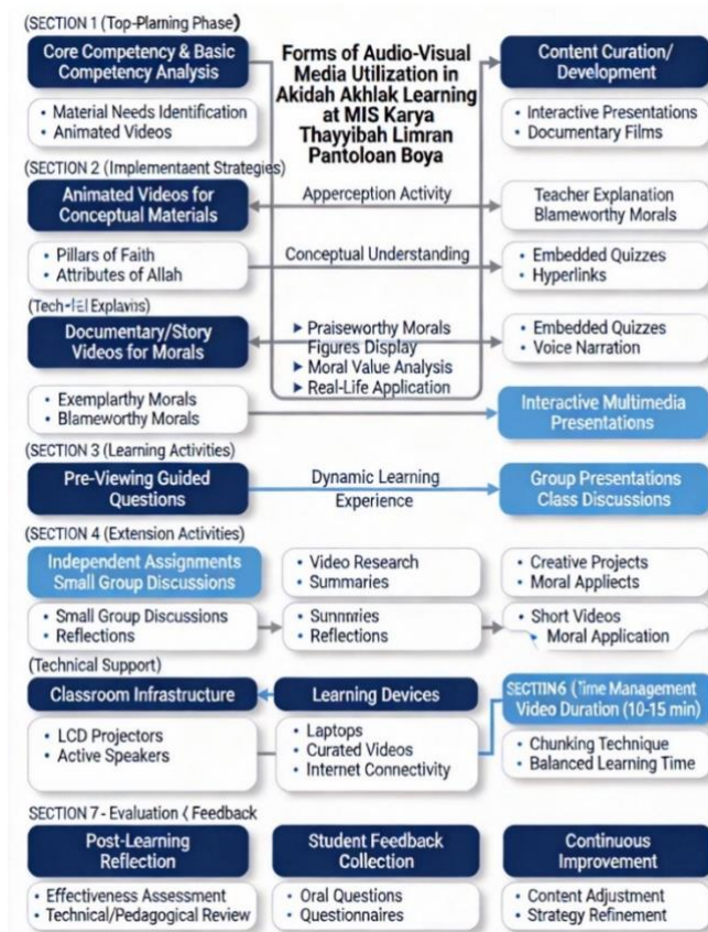
Figure 2. Forms of audiovisual media utilisation

The implementation strategy also strengthened the argument that interactive multimedia learning can substantially support religious education, as it engages multiple sensory modalities and promotes active meaning-making consistent with constructivist learning theory (Vygotsky & Cole, 1978; Wildan & Bunyamin, 2025). These findings make contextual contributions by showing that the success of audiovisual media implementation depends not only on technology availability but also on teachers' ability to curate content, design integrative learning strategies, and facilitate reflective discussions that link visualisation with conceptual understanding, dimensions that previous experimental-quantitative studies have not adequately explored.